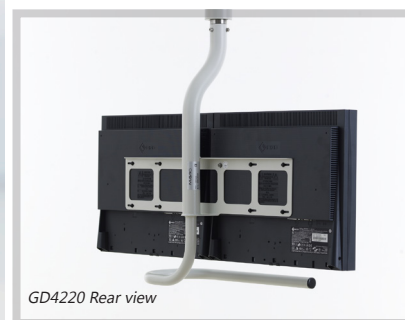
GD4220 Rear view