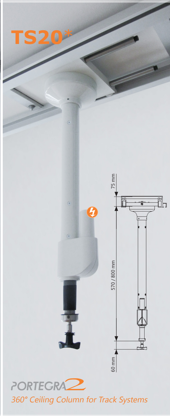
PORTEGRA 2 360° Ceiling Column for Track Systems