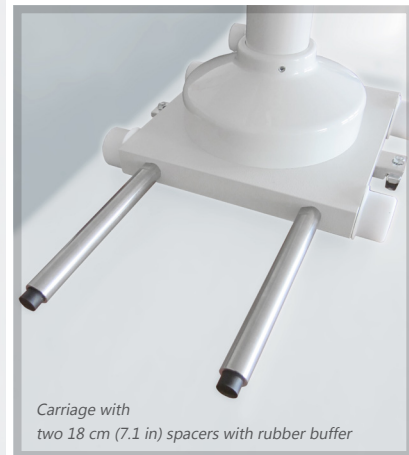
Carriage with two 18 cm (7.1 in) spacers with rubber buffer

Model Variants: TS15011/21/31 Twin Column with carriage plus spacer (please refer to table below for different lengths) TS20311/21 360° Column with carriage plus spacer (please refer to table below for different lengths)