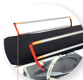
Non-standard barrier colours (optional)