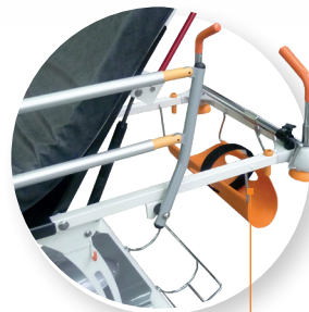
Oxygen bottle holder (optional)