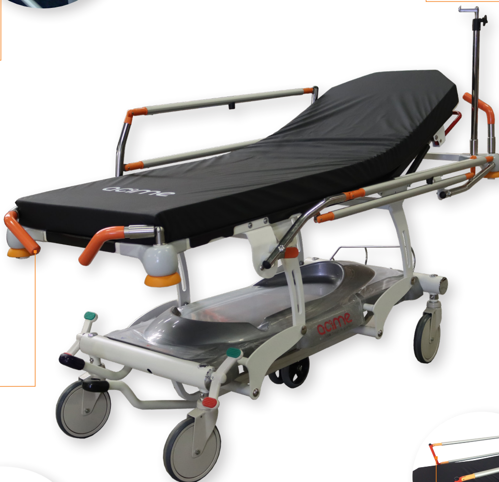
Foldable handles (optional)